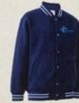
Bomber Jacket $33.80