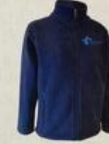
Polar Fleece Jacket $33.80