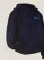
Hooded Windcheater $33.80