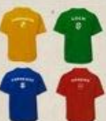
House T-Shirt $11.95