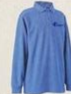
Long Sleeve Polo $19.35