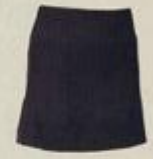
Poly Yoke Skort $25.60