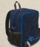
Primary Physiopak III $41.50

See your office or uniform facilitator to test and try on any item.